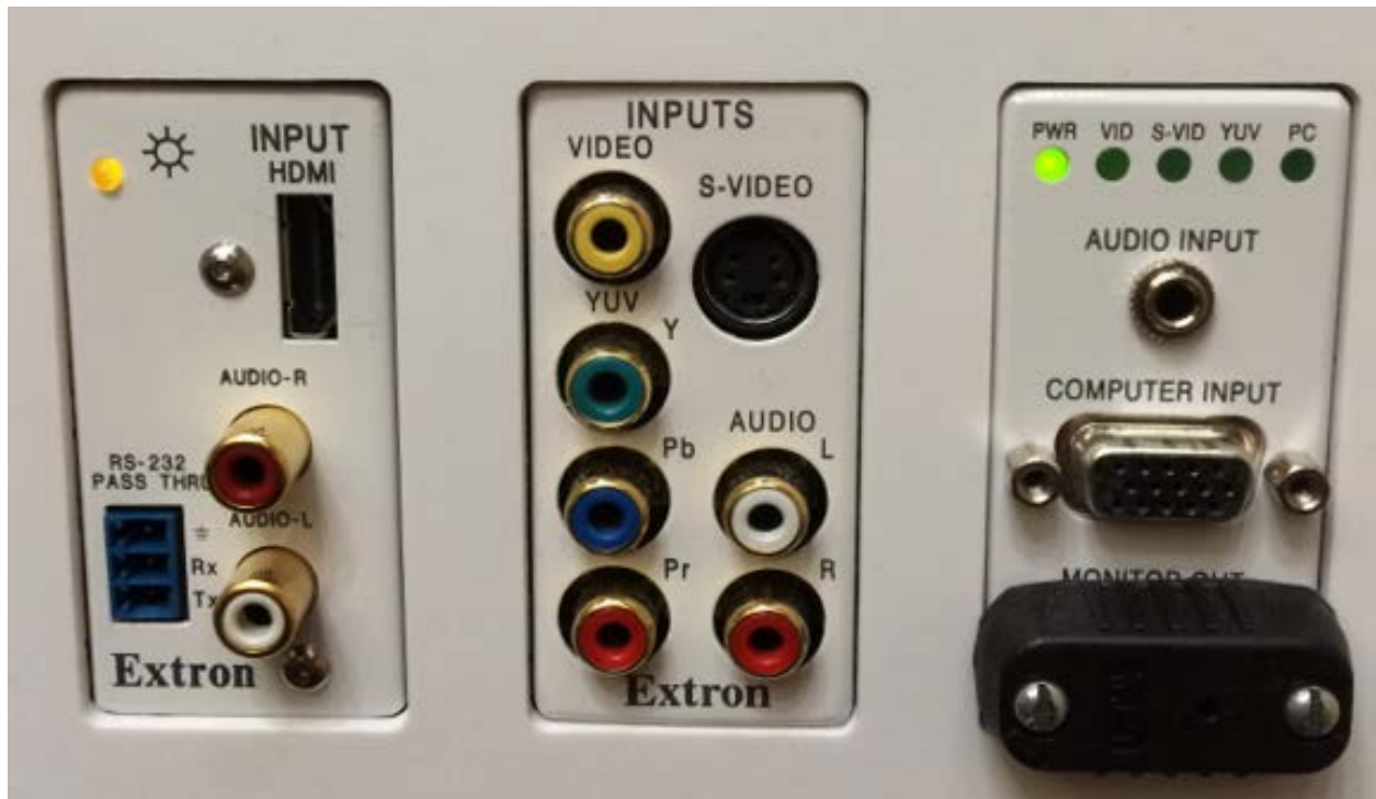
Plug in your audio and/or visual equipment into the inputs in the lower panel.