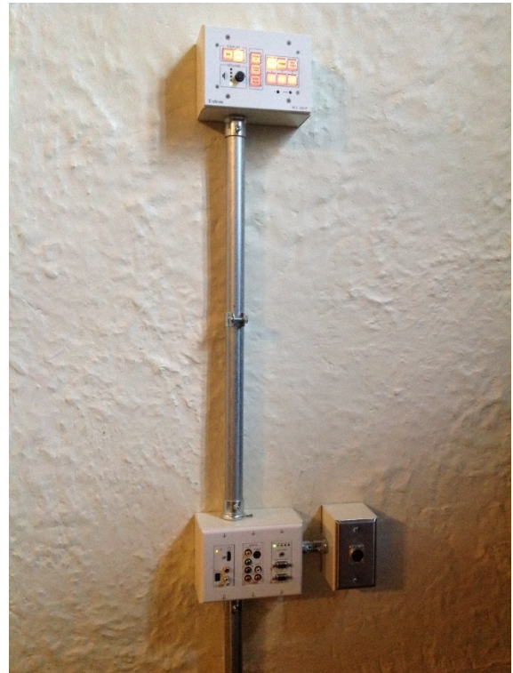
The AV controls are located in the back of the Great Hall, to the left of the window.